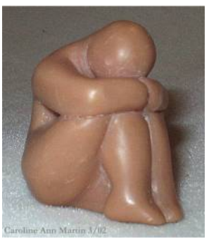
Figure 2: "An alienated student" (my characterization).

A teacher in a multicultural classroom will note that if there is something that the students have not understood during the presentation/lecture many students will not revert to the teacher but rather go to a colleague who has been noted to be clever in class. A second source for information is the www. At the computer, searching for technical information, the average WMU student spends three to four hours per day. If this practice is common and if students communicate by e-mail instead of talking to each other between four eyes an alienated student (same as an alienated seafarer) will be the result. An unhappy person cannot perform well, see figure 2.